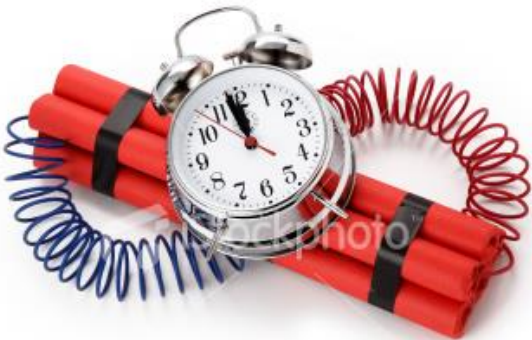
This Photo licensed under CC BY-SA